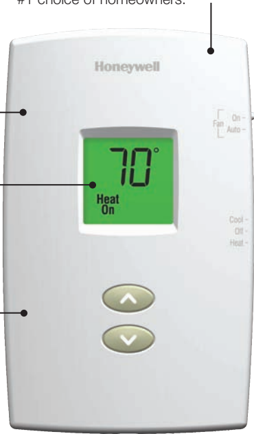
PRO 1000 Non-Programmable