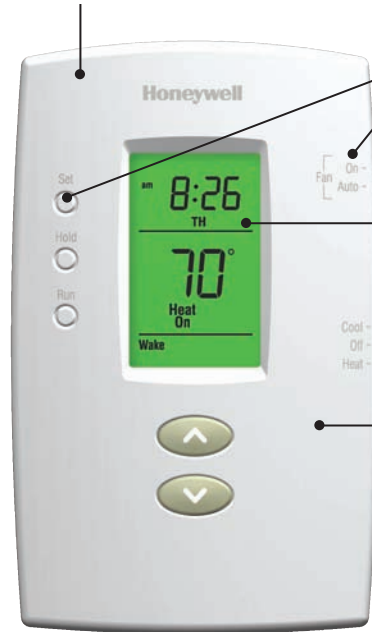
PRO 2000 Programmable

Simple-Set Programming – Basic operation makes it easy to set the heat, cool, fan and program schedules that fit your customers' lifestyle. Simplicity helps to reduce callbacks.